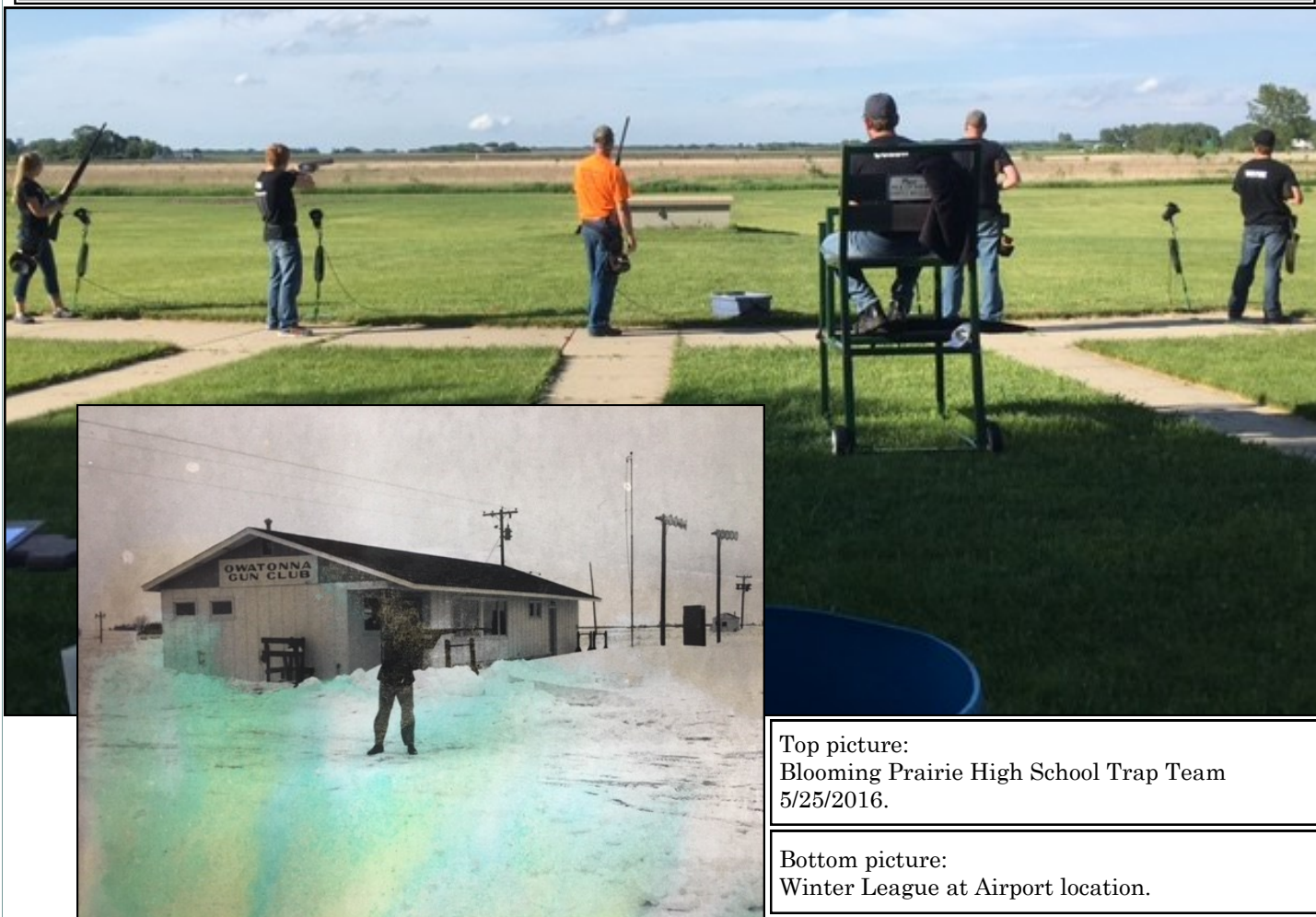
Top picture: Blooming Prairie High School Trap Team 5/25/2016.

We will be closed on Sunday, September 4th!