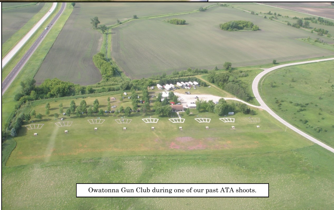
Owatonna Gun Club during one of our past ATA shoots.